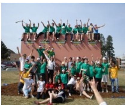
ISAP's TRU Survivor Event

ISAP provides a range of activities and celebrations for international students at TRU. ISAP collaborates with TRU Recreation, TRUSU (Student Union) and TRU Orientation. Faculty and staff are welcome to participate.